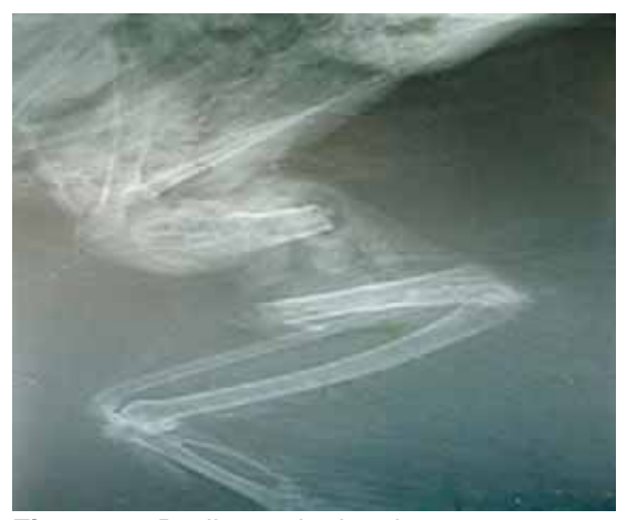
Figure 2. Radiograph showing transverse, mid-shaft fracture of humerus

Open surgical reduction and closure of wound was resorted to following preoperative ceftriaxone (50 mg/kg) and ketoprofen (2 mg/kg) administration intramuscularly. General anesthesia was induced with ketamine hydrochloride (30 mg/kg), given intramuscularly. The feathers were plucked followed by debridement and lavage of wound with isotonic saline and then by 0.05% chlorhexidine after plugging the proximal fractured end with sterile cotton. In lateral recumbency, the site was aseptically prepared and draped. A 10.5 cm long, 3 mm Steinmann pin was driven in a retrograde fashion, directed proximally and was progressed distally, until it was seated on to the medial epicondylar epiphysis. The muscles were apposed with 3.5 metric polyglactin 910 by simple continuous suture pattern followed by the skin wound using 3.5 metric nylon in