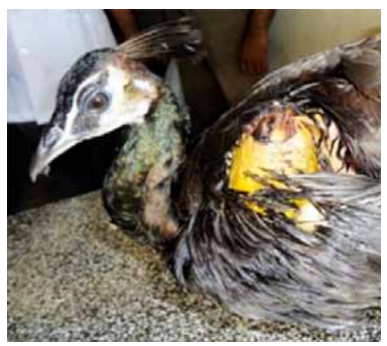
Figure 1. Peahen with wound on the shoulder on presentation

bone was found protruding out on close examination. Crepitus was also felt and she exhibited severe pain. No sign of any bruise, laceration or contusion were noticed elsewhere in the body. Radiographs confirmed an open, transverse, middiaphyseal fracture of the humerus with widely displaced fragments (Figure 2). In